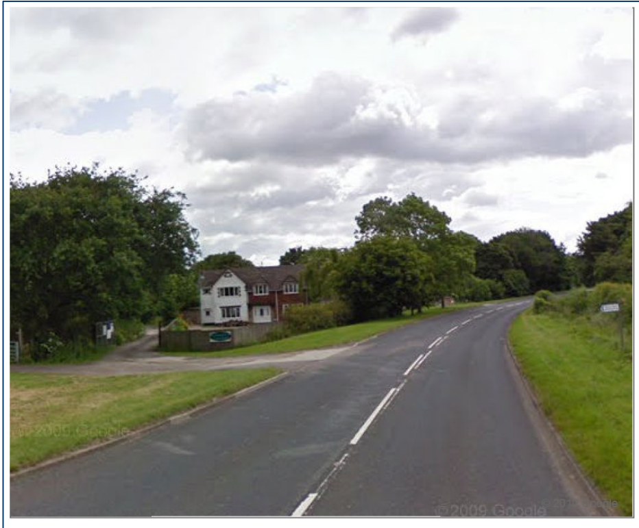
The Entrance (east bound)